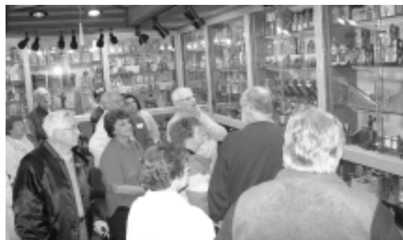
Room after room of amazing toys to see.