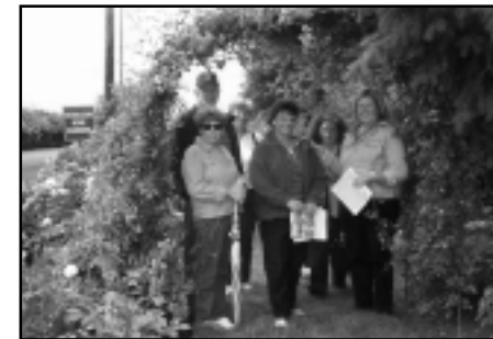
Mayflowers take in sights at Heirloom Rose Gardens.

Next on the agenda for the Mayflowers is a trip on July 7th to McMenamins Edgefield and down-